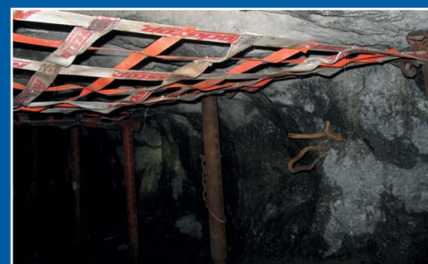
Rockstop provides support right up to the working face